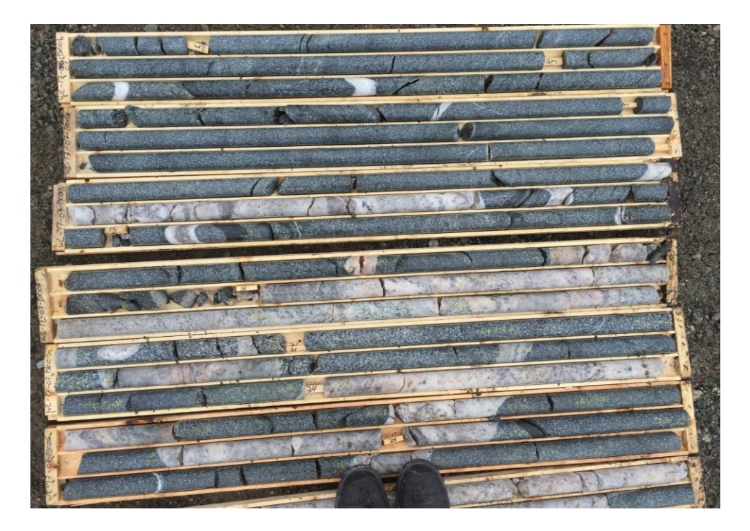
Photo 1 Photo highlighting pegmatite dykes, often spodumene bearing, in hole WL17-07 showing core from 2.6 m to 30.5 m downhole (link to larger version: <u>https://goo.gl/Dv9J5e</u>)

Map 1: Drill hole location (link to larger version: <u>https://goo.gl/9bYrl9</u>)